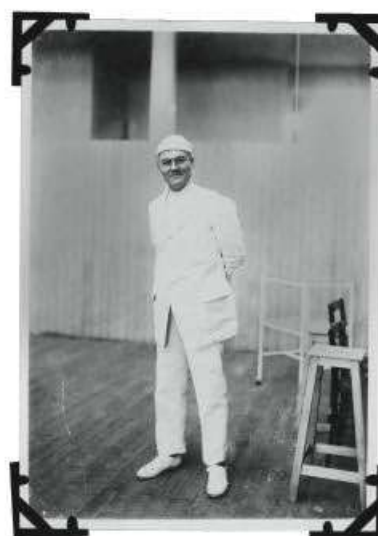
George W. Crile