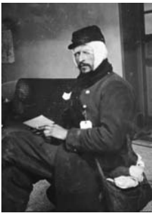
Soldier seated in the receiving area of the American Ambulance. A triage tag has been attached to his coat button.