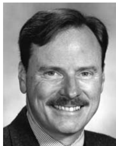
FROM THE DITTRICK MEDICAL HISTORY CENTER