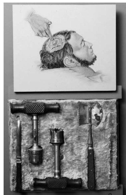
Detail from the “If You Were Sick in 1810” exhibit.