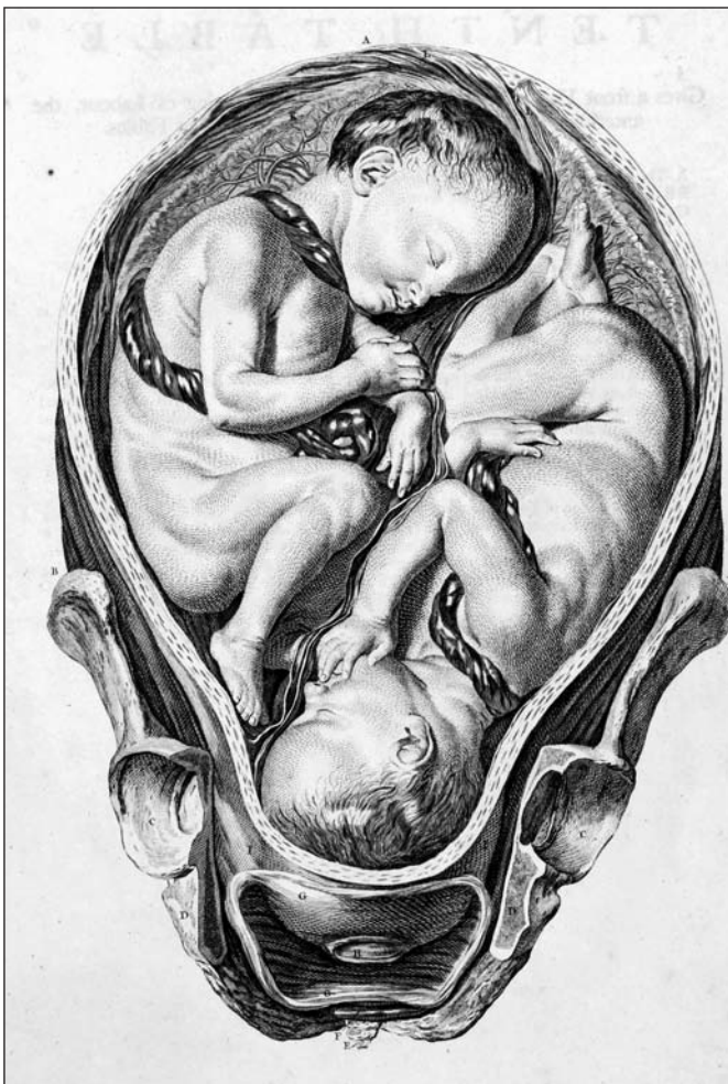
Rymsdyk illustration from William Smellie's A sett of anatomical tables with explanations.