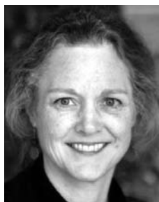
FROM THE CLEVELAND HEALTH SCIENCES LIBRARY