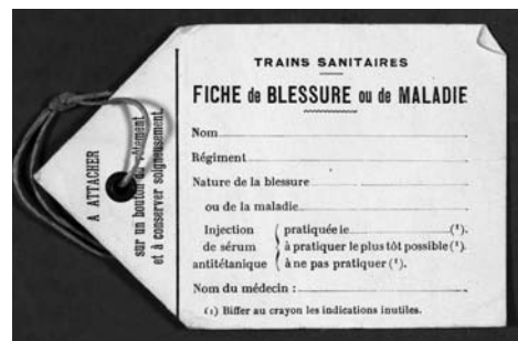
Above; Tag attached to triaged soldier indicating the nature of his wound or illness and whether or not he had been given a tetanus shot.