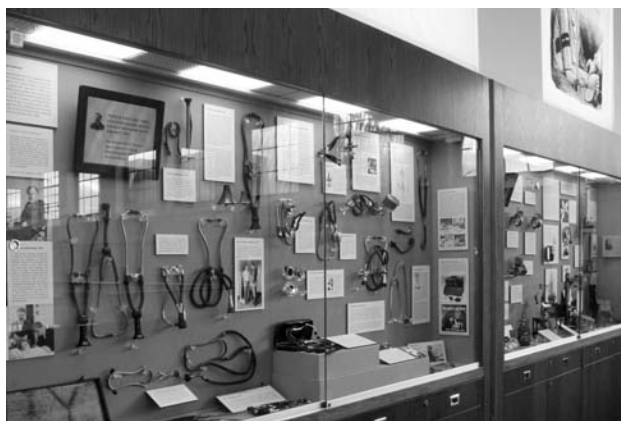
New exhibits in the Blaurox Hall of Diagnostic Instruments.