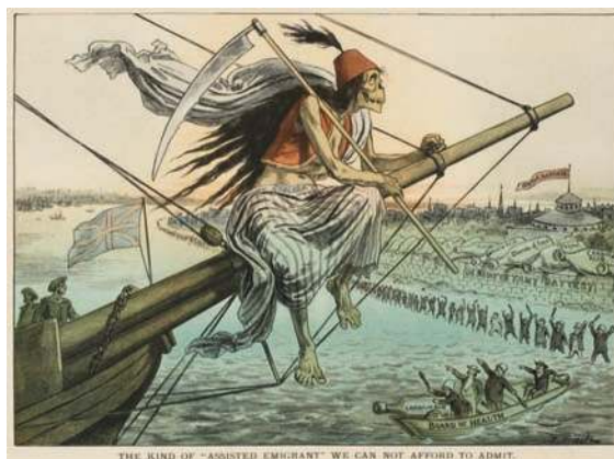
Satirical cartoon of cholera spreading from Europe to the U.S., Puck Magazine, 1883.

Medicine's leaders in Cleveland, and in cities across the country, took an abiding interest in how scientific medicine might also transform public health. Their civic involvement in this arena borders on the heroic, combatting outbreaks of smallpox, securing a safe water supply to vanquish typhoid, and focusing attention of the purity and safety of milk to forestall tuberculosis. In our exhibits we have often touched upon various aspects of this transformation, but chiefly with a focus on particular diseases. We are broadening this approach in some new displays on Cleveland's public health initiatives and accomplishments. One display will look at water, first as a breeding ground for disease vectors (mosquitos, malaria and yellow fever), then a thoroughfare for epidemics (cholera), and as a necessity of life that sometimes carried ill-