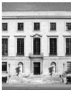
FROM THE CLEVELAND HEALTH SCIENCES LIBRARY